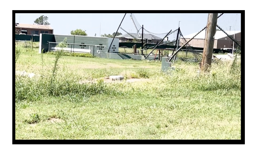
For Every Goliath There Is A Rock...