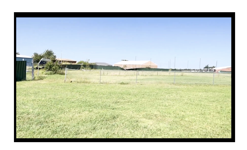
When Leadership Fails To Protect The Integrity Of The Game...